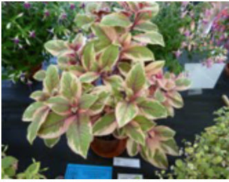
Pot ornamental foliage (not Tom West ) Alan Richards 2nd Firecracker