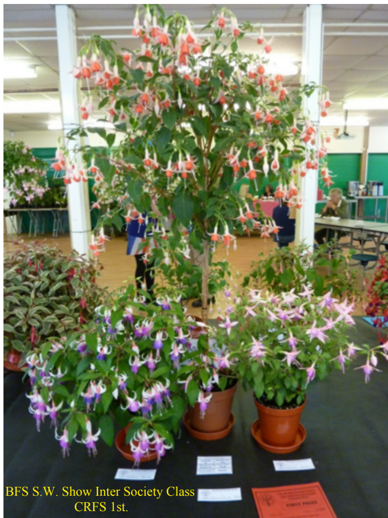
BFS S.W. Show Inter Society Class CRFS 1st.

The Monthly Newsletter of The Camborne - Redruth Fuchsia Society